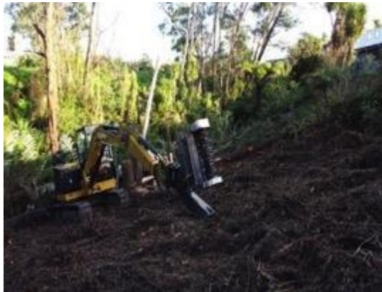
Figure 22: Mulching excavator at Rosedale Park

Areas with larger pest trees (e.g. wattle, privet) have been cut and material chipped by smaller chipping machines such as at Pourewa Creek Recreation Reserve. In some areas including Rosedale Park, a larger mulching attachment to an excavator is used to chip pest trees from the top down and return them to the soil to provide mulch for future restoration planting.