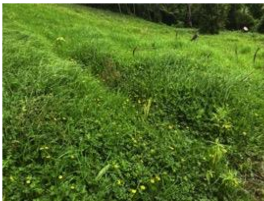
Figure 22: Cover crop planted after area mulched at Rosedale Park

As part of site preparation, a cover crop is sown to prevent pest plants reestablishing, with native pioneer trees planted in the following planting season. This is a non-chemical alternative for site preparation for restoration planting.