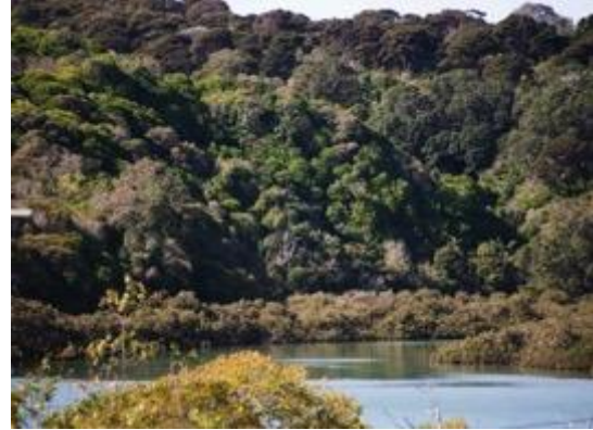
Figure 9: Coastal forest canopy (Kapa Bush)

A robust understory exists beneath these canopy species; and as figure 10 shows extensive volunteer and eco-contractor pest plant control in areas like Kapa Bush is managing pest plant incursions (climbers and ground cover species) which can prevent the regeneration of indigenous plants. This includes climbing asparagus, tradescantia and japanese honeysuckle. Some areas of pest plant incursions exists in the Pourewa Creek Recreation Reserve, including english ivy as shown in figure 11.