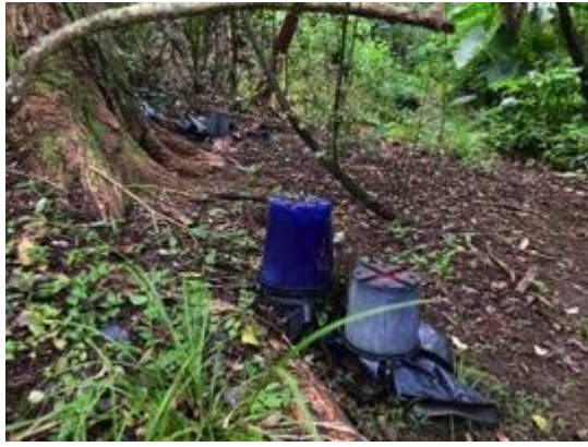
Figure 20: Privet stumps covered in polythene and plastic posts (Jesse Tonar Reserve)