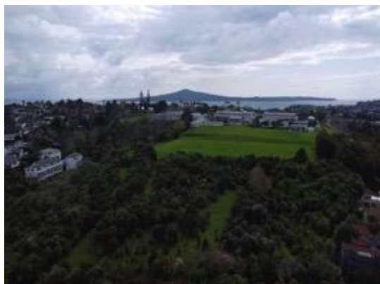
Figure 6: Selwyn Park aerial view

Some areas of vegetation along the ridges below Selwyn College (Selwyn Park) comprise a wide mix of indigenous (native restoration) plantings of species including kanuka, cabbage tree, harakeke, karaka, puiriri, and various grasses and sedges. Several pest plant species, including gorse are growing at the edge of these indigenous plantings. These areas are classified as PL because the weed biomass is less than 50% and it is a native amenity planting.