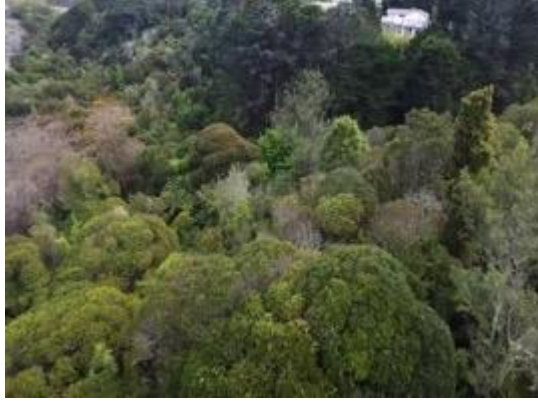
Figure 12: Selwyn Bush canopy

The forest areas in Selwyn Bush and below Selwyn Park consists of exotic canopy trees including macrocarpa, privet, willow and plane trees. A discrete number of emergent indigenous canopy trees include puriri. Exotic trees are generally dominant in the canopy with over 50% cover/biomass exotic. Extensive historic indigenous understory planting by volunteers is changing the exotic/indigenous composition.