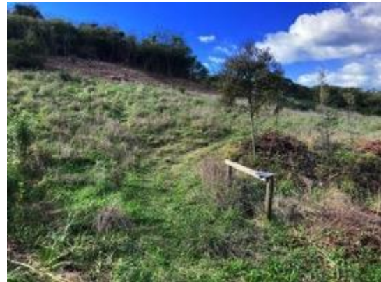
Figure 23: Cut and chipped area of tree privet on Pourewa Creek Reserve

As part of site preparation, a cover crop is sown to prevent pest plants reestablishing, with native pioneer trees planted in the following planting season. This is a non-chemical alternative for site preparation for restoration planting.