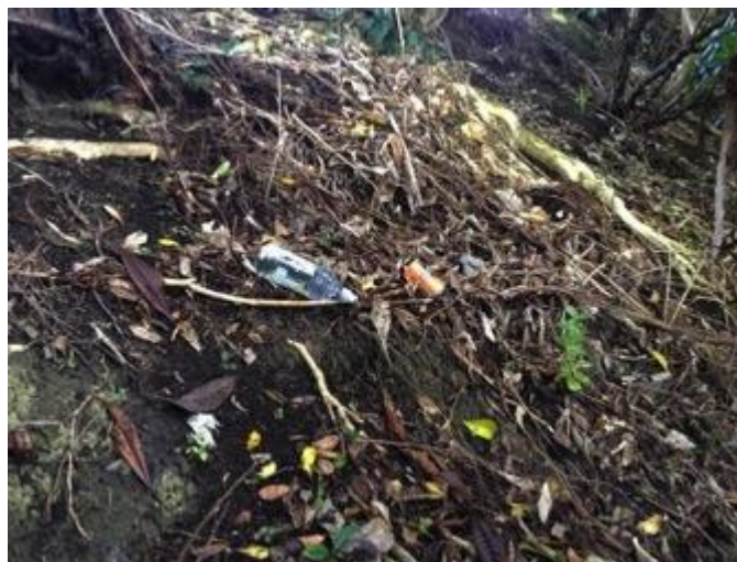
Figure 25: Discarded rubbish in reserves

There are scattered items of rubbish throughout the reserves, particularly in the coastal forest understory adjacent to walkways. This rubbish appears more likely to be single discarded items, rather than being dumped rubbish. Nevertheless, these items significantly reduce the amenity of the coastal forest and reserve areas.