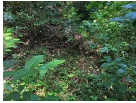
Figure 21: Cut and stack of privet seedlings in Ngapiipi Reserve.