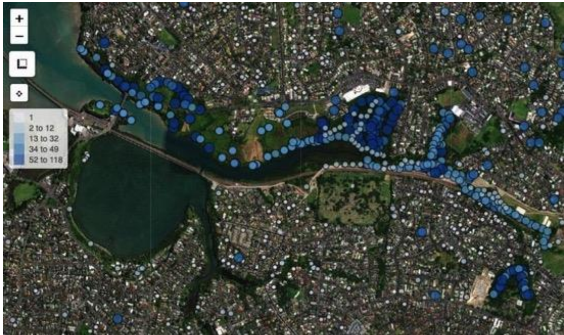
Figure 24: Pest animal control sites in Pourewa Valley