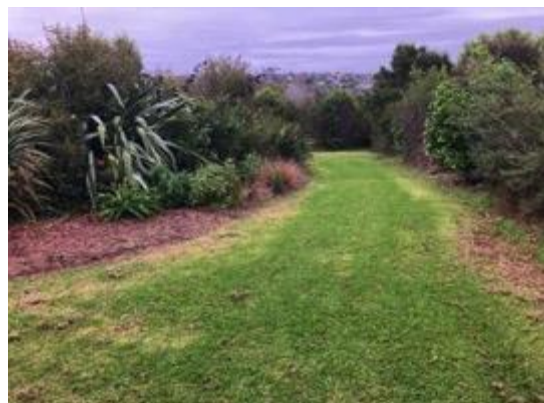
Figure 7: Selwyn Park