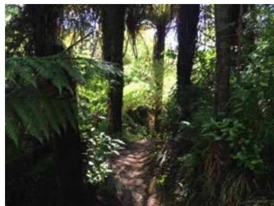
Track on Waka Kotahi land looking towards Kepa Bush

The valley also provides an important transport link, with vehicle traffic moving along the north and south of the valley via Kepa Road and St Johns Road. The Eastern train line also passes through the valley, with the Meadowbank and Orakei Railway stations located to the south of Pourewa Creek. The shared pathway also provides active transport access through the valley, with connections at John Rymer Place and Tahapa Reserves.