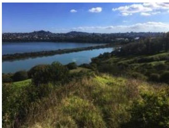
Pourewa Creek looking towards Orakei Basin

The valley’s reserves and open and green spaces provide opportunities for recreation. An existing track network in Kepa Bush, Pourewa Creek Recreation Reserve, Selwyn Park and Selwyn Bush allow visitors to access Pourewa Creek from Kepa Road. On-the-water recreation occurs in the Pourewa Creek, Hobson Bay and the adjacent Orakei Basin and out to the coast to Okahu Bay.