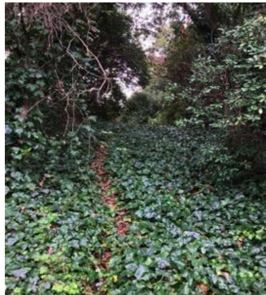
Figure 11: English Ivy dominating the understory in Pourewa Creek Recreation Reserve

Due to greater than 50% of canopy cover being indigenous, a healthy understory and over 80% of canopy cover of trees and shrubs these coastal area are defined as coastal broadleaved forest (WF4) dominated by pohutukawa and puriri.