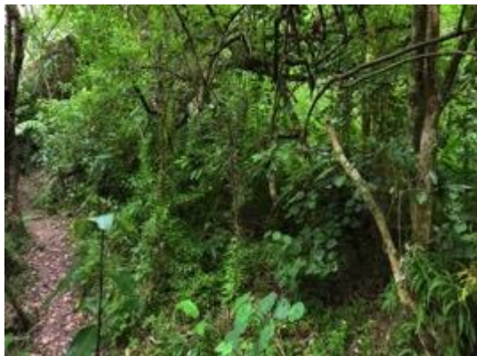
Figure 14: Climbing asparagus growing towards canopy species

A robust understory exists beneath these canopy species; however as figures 14 and 15 show pest plants are also climbing up trees and smothering them as well as forming a dense ground cover which is stopping the regeneration of indigenous plants. This includes climbing asparagus and tradescantia.