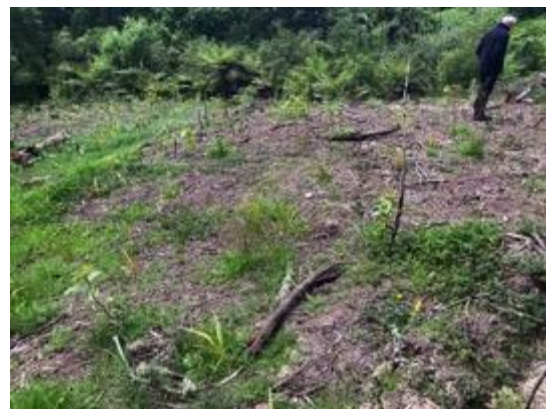
Figure 23: Planting within mulched area with cover crop at Rosedale Park