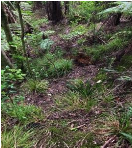
Figure 10: Understory in Kapa Bush

A robust understory exists beneath these canopy species; and as figure 10 shows extensive volunteer and eco-contractor pest plant control in areas like Kapa Bush is managing pest plant incursions (climbers and ground cover species) which can prevent the regeneration of indigenous plants. This includes climbing asparagus, tradescantia and japanese honeysuckle. Some areas of pest plant incursions exists in the Pourewa Creek Recreation Reserve, including english ivy as shown in figure 11.