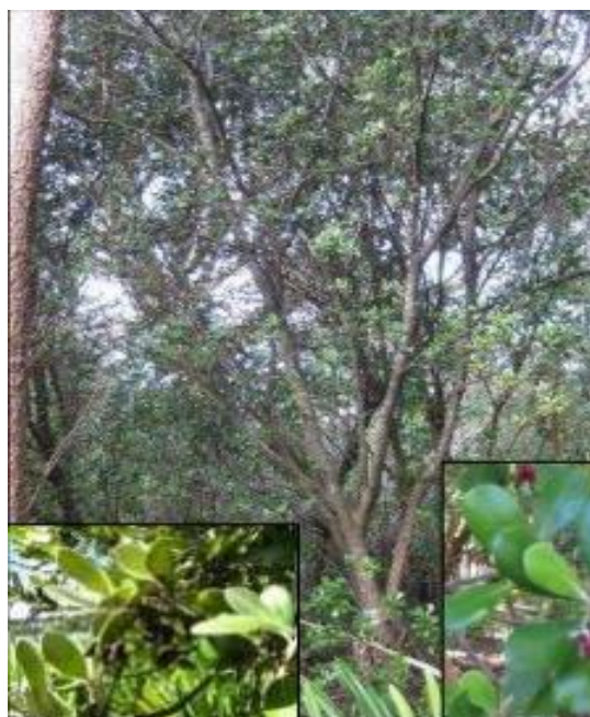
Figure 19: Karo