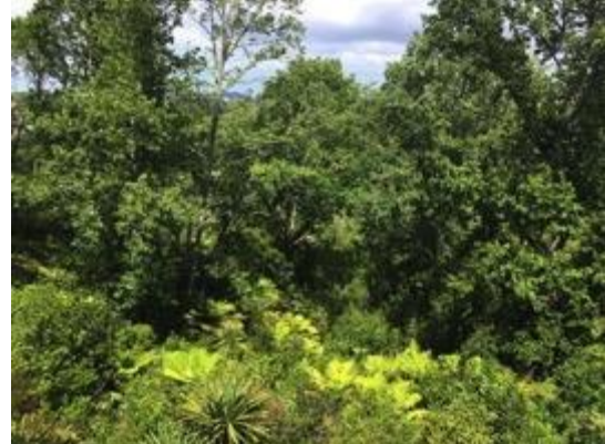
Figure 13: Exotic canopy with emergent native understory

A robust understory exists beneath these canopy species; however as figures 14 and 15 show pest plants are also climbing up trees and smothering them as well as forming a dense ground cover which is stopping the regeneration of indigenous plants. This includes climbing asparagus and tradescantia.