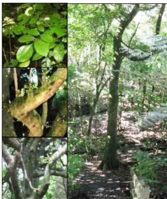
Figure 18: Kohekohe