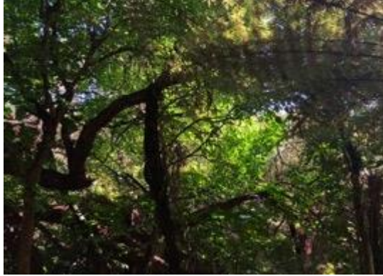
Figure 8: Kapa Bush

A discrete number of exotic canopy trees include poplar, flame tree and some tree privet are prevalent in the coastal margin of the Pourewa Creek Recreation Reserve. Indigenous trees are dominant in the canopy. An area above and opposite the John Rymer entrance to the shared path is also WF4, but does have some tree privet in the canopy.