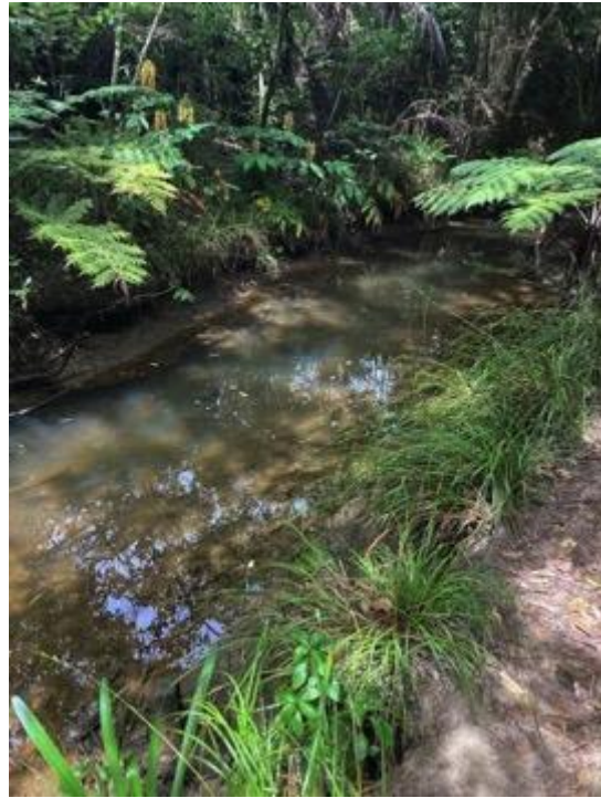
Figure 17: Carex and ginger in stream margins