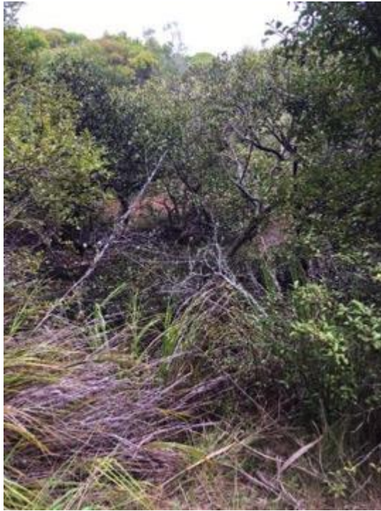
Figure 16: Mangroves

The lower reaches of the Pourewa stream is an area of frequent tidal inundation dominated by mangroves. In the salt-freshwater mixing zone, there is the presence of a number of in-stream species including tuna – eel and inanga – whitebait, the later of which spawns in the stream edge carex grasses. Pest plants present in the streamside margins includes ginger.