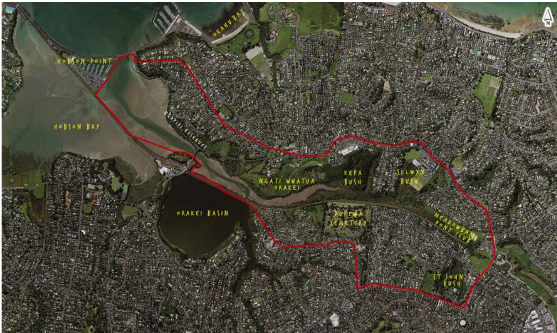
Figure 1: Project area covered by the restoration plan