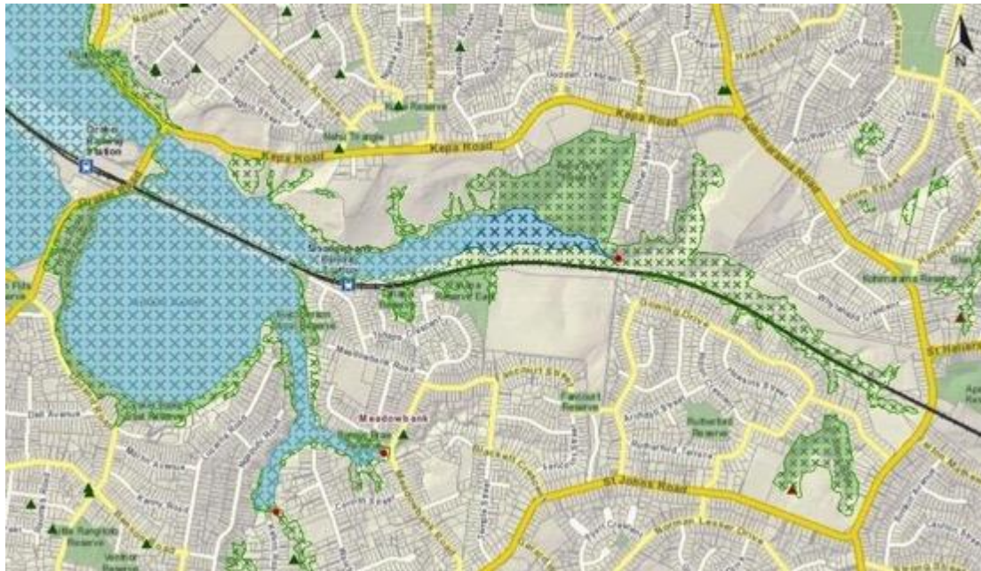
Figure 4: Significant Ecological Areas (SEA's) in the reserve areas