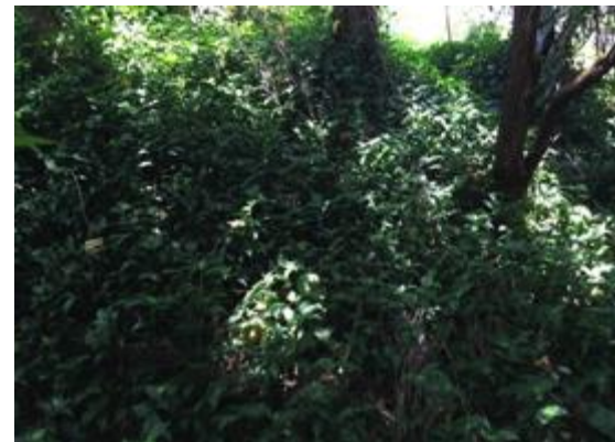
Figure 15: Tradescantia dominating the understory

Due to greater than 50% of cover/biomass being exotic, and the future trajectory of composition being uncertain this area is defined as exotic scrub (ES).